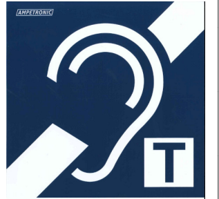
An induction loop is provided for the benefit of hearing aid users. To use please switch your hearing aid to 'T'

If your hearing aid does not have a T coil switch and if your hearing aid doesn't work with our new hearing assist loop, please speak with the Deacon on Duty who will be able to provide you with a hearing receiver for use during our worship service.